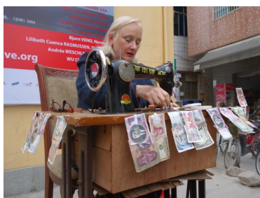
Tanya Mars at the Guangzhou Live Festival of Performance Art in China, 2013, performing "Rare Parity," a durational, task-oriented performance using foreign currency as its primary material.

SCAC is very pleased to have such an important artist on the board.