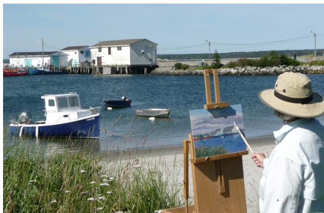
Lockport Crescent Beach "PaintOut"

Grants are made on an ongoing basis as applications are received. There is no deadline. Although this granting budget is only $1000 per